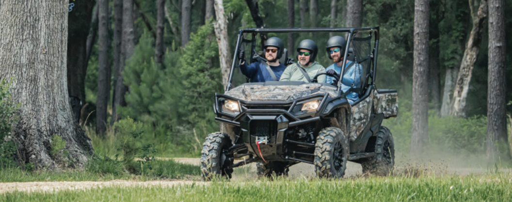
Pioneer 1000 Deluxe