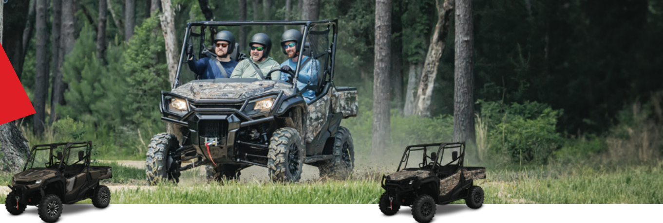
Pioneer 1000 Trail