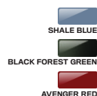
Pioneer 1000 EPS