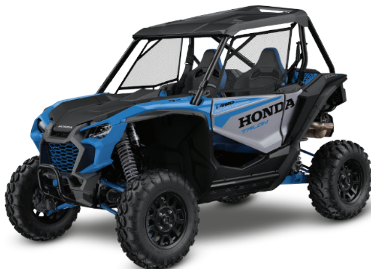
Talon 1000XS Fox Live Valve