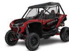
TALON 1000X FOX Live Valve