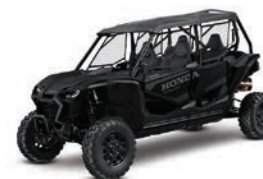
TALON 1000X-4 FOX Live Valve