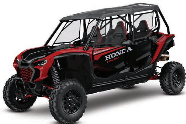
2022 Talon 1000X-4 FOX Live Valve