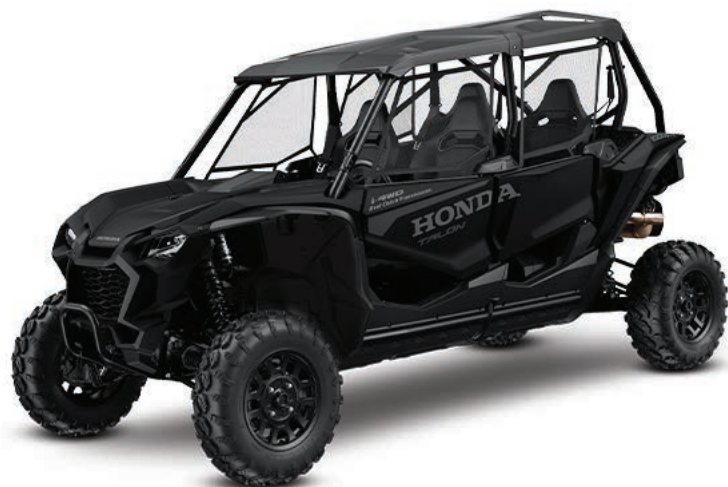
2022 Talon 1000X-4