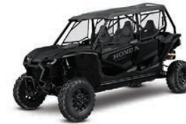
TALON 1000X-4 FOX Live Valve