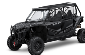
Talon 1000X-4 Special Edition