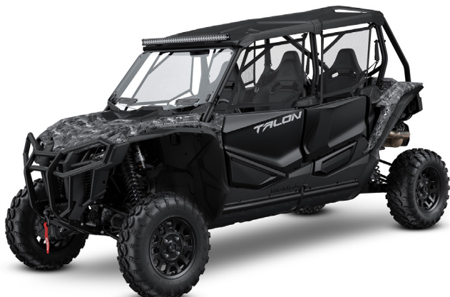
Talon 1000X-4 Special Edition