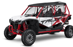
Talon 1000X-4 Fox Live Valve