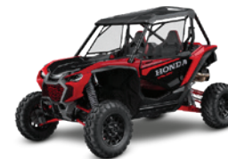
TALON 1000R FOX Live Valve