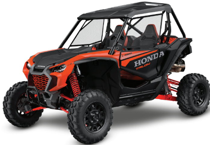
2022 Talon 1000R