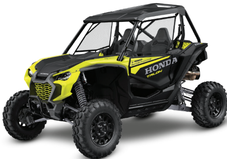
2022 Talon 1000R FOX Live Valve

PEARL RED MATTE ABYSS BLACK TONIC YELLOW PEARL