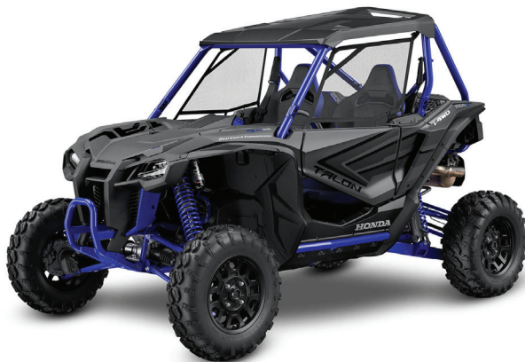
Talon 1000R FOX Live Valve