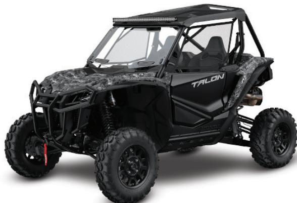
Talon 1000R Special Edition