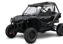
Talon 1000R Special Edition