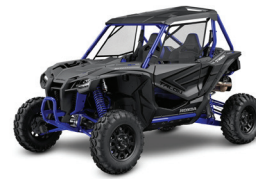
Talon 1000R FOX Live Valve