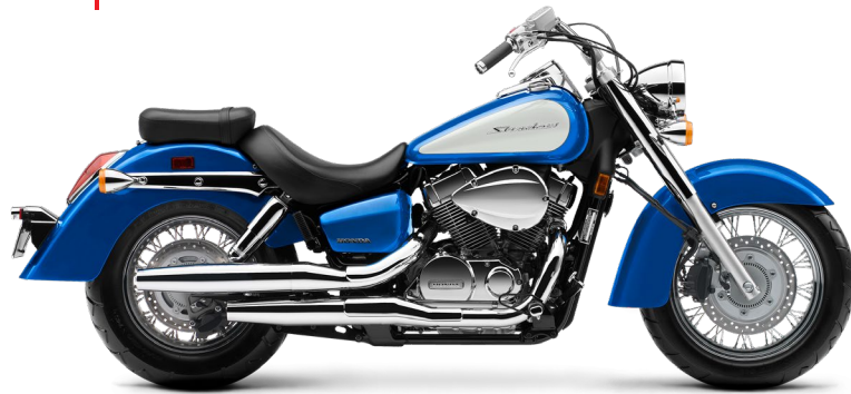
ULTRA BLUE METALLIC