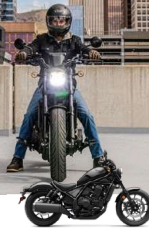
Rebel 1100 DCT