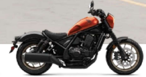
Rebel 1100 DCT Special Edition