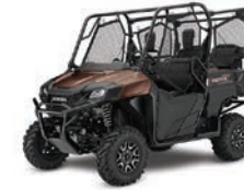
Pioneer 700-4 Deluxe