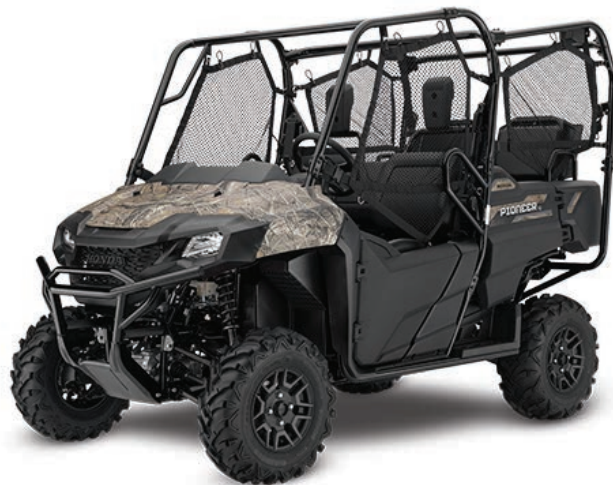
Pioneer 700-4 Deluxe

With the Honda Pioneer 700-4 Deluxe, you can let the automatic transmission shift for you, or you can take charge and choose which gear you want for yourself via the steering column mounted paddle shifters—you can even shift from auto to manual (AT to MT) on the fly!