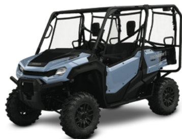
Pioneer 1000-5 Deluxe