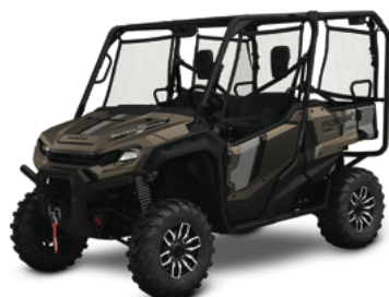
Pioneer 1000-5 Deluxe Trail