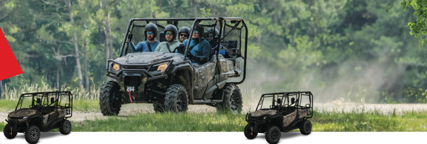
Pioneer 1000-5 Trail