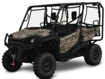
Pioneer 1000-5 Forest