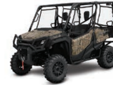
Pioneer 1000-5 Forest