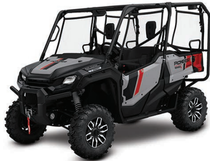
Pioneer 1000-5 Trail