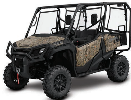
Pioneer 1000-5 Forest