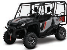
Pioneer 1000-5 Trail