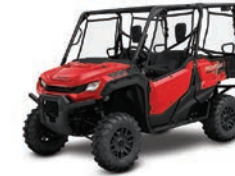
Pioneer 1000-5 Deluxe