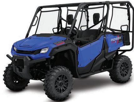
Pioneer 1000-5 Deluxe