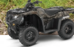
FourTrax Rancher 4X4