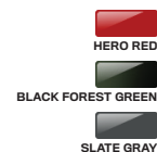
FourTrax Rancher 4x4 Automatic DCT IRS EPS