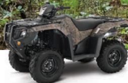
FourTrax Foreman Rubicon 4x4 EPS