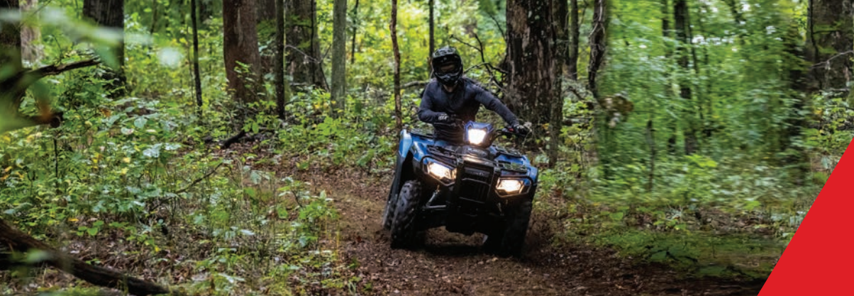
FourTrax Foreman Rubicon 4x4 EPS