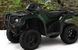
FourTrax Foreman Rubicon 4x4 Automatic DCT