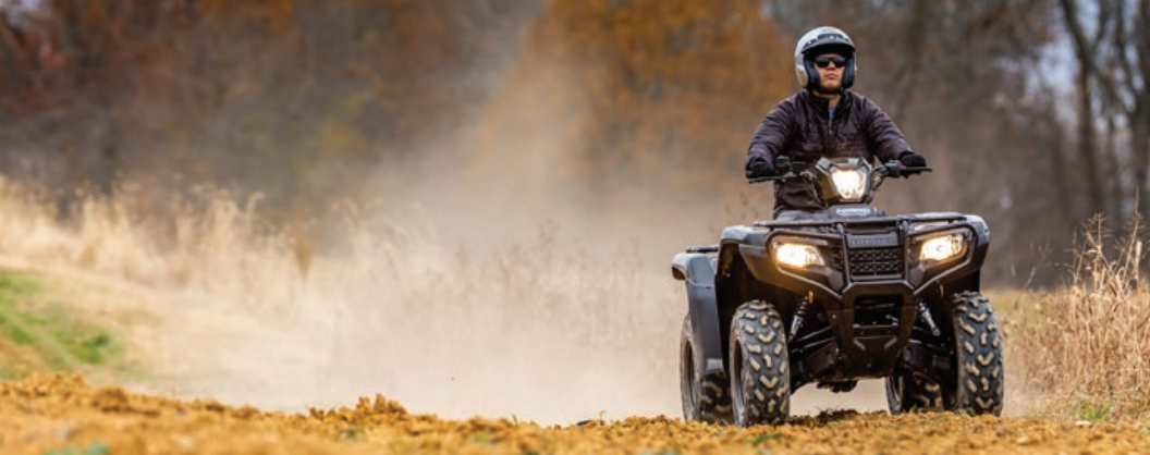
FourTrax Foreman 4x4