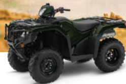
FourTrax Foreman 4x4