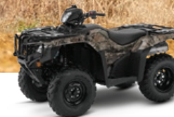
FourTrax Foreman 4x4 EPS