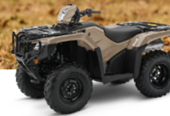
FourTrax Foreman 4x4 ES EPS