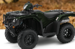
FourTrax Foreman 4x4