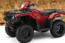
FourTrax Foreman 4x4 EPS