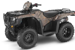
FourTrax Foreman 4x4