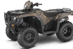
FourTrax Foreman 4x4 EPS