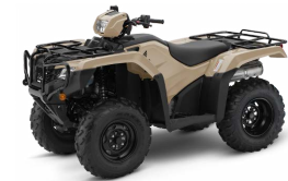
FourTrax Foreman 4x4 ES EPS