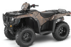
FourTrax Foreman 4x4 MSRP $7,399*