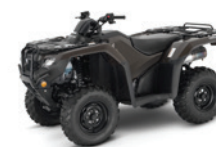
FourTrax Foreman 4x4 ES EPS MSRP $8,349*