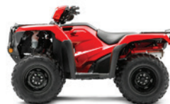
FourTrax Foreman 4x4 EPS MSRP $8,099*