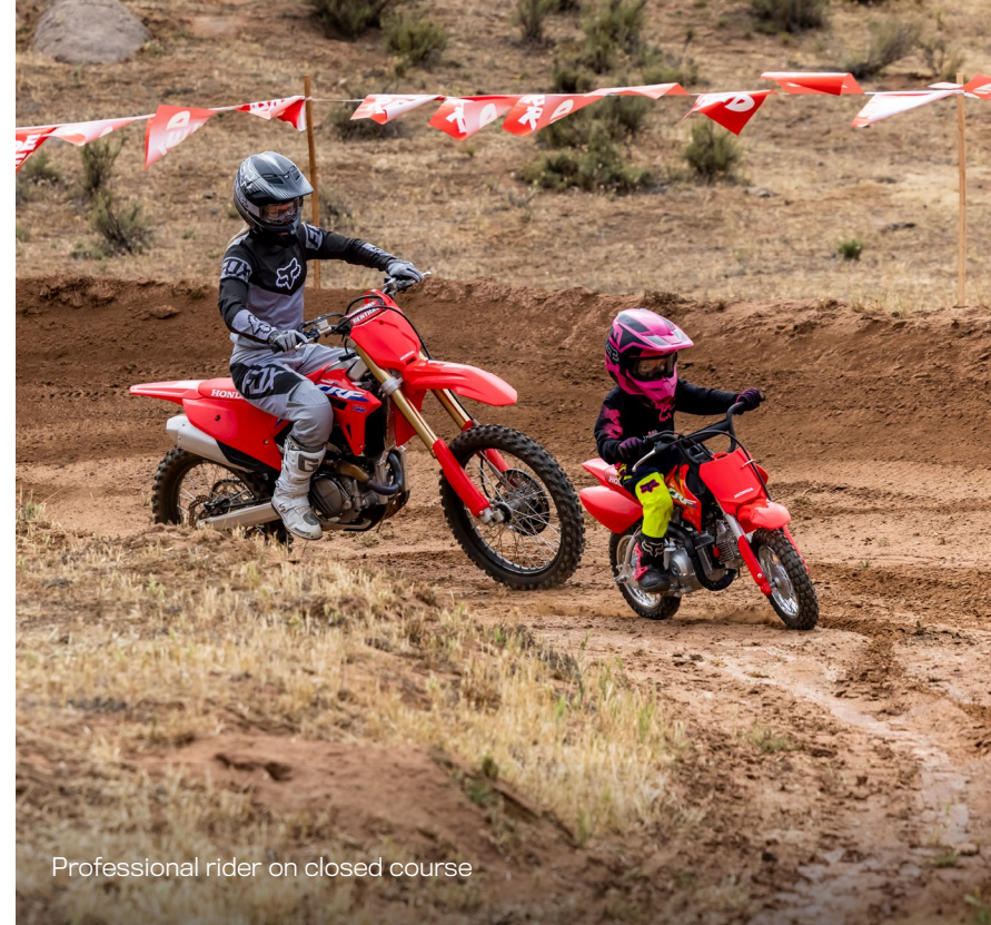
Professional rider on closed course

PARENTS NEED TO CONSIDER A RIDER'S AGE, SIZE, ABILITY AND MATURITY BEFORE ALLOWING THEM TO RIDE. ALWAYS WEAR A HELMET, EYE PROTECTION AND PROTECTIVE CLOTHING, AND PLEASE RESPECT THE ENVIRONMENT. Always stay on established trails in approved riding areas. CRF ® is a registered trademark of Honda Motor Co., Ltd. ©2021 American Honda Motor Co., Inc.