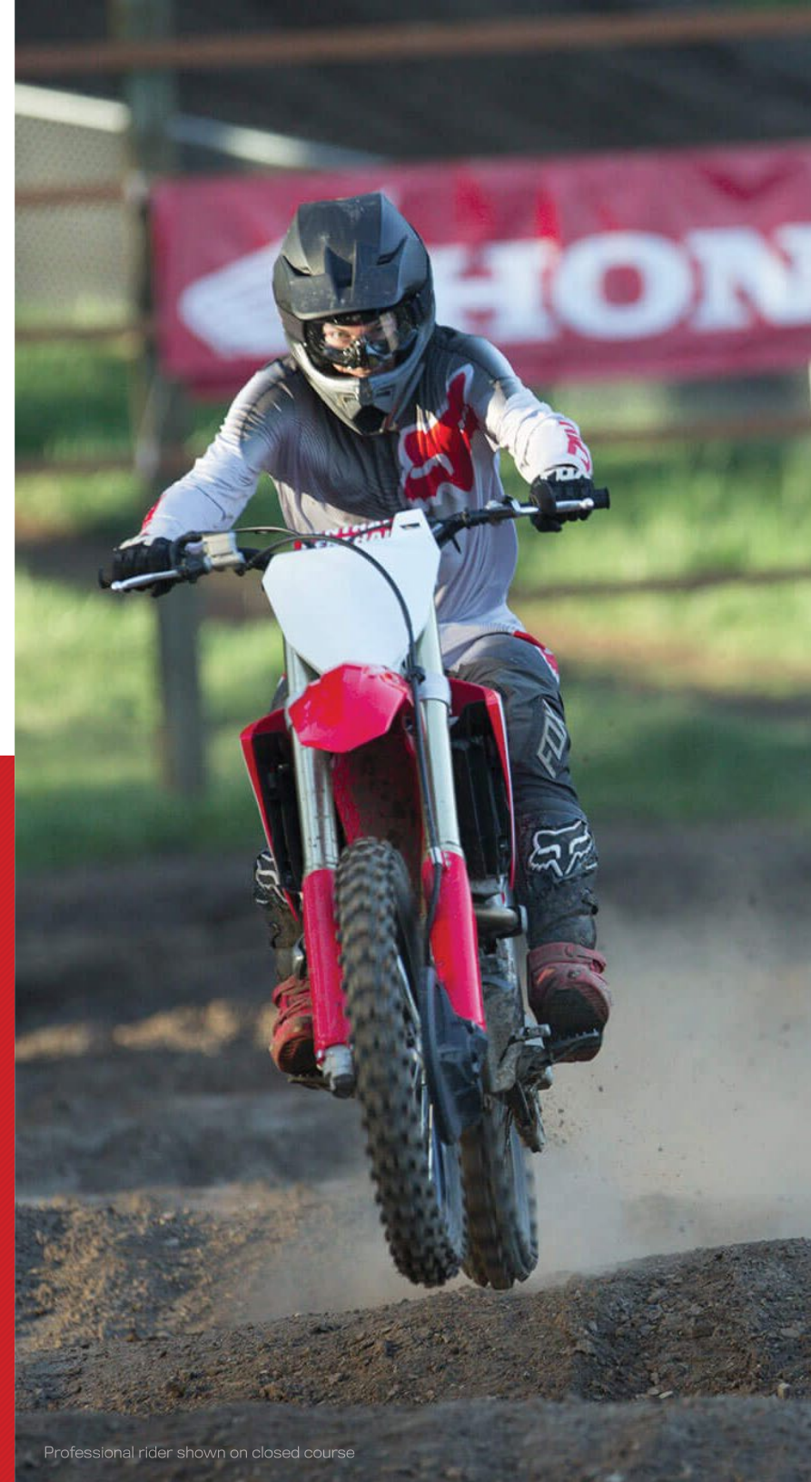
Professional rider shown on closed course

CRF250R IS INTENDED FOR CLOSED-COURSE OPERATION ONLY. ALWAYS WEAR A HELMET, EYE PROTECTION AND PROTECTIVE CLOTHING, AND PLEASE RESPECT THE ENVIRONMENT, OBEY THE LAW AND READ THE OWNER'S MANUAL THOROUGHLY. CRF® is a registered trademark of Honda Motor Co., Ltd. ©2020 American Honda Motor Co., Inc.