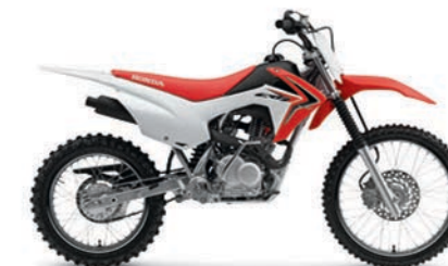
CRF125F // BIG WHEEL