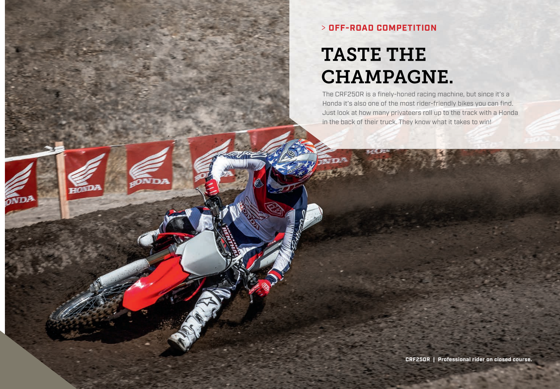
CRF250R | Professional rider on closed course.

The CRF250R is a finely-honed racing machine, but since it's a Honda it's also one of the most rider-friendly bikes you can find. Just look at how many privateers roll up to the track with a Honda in the back of their truck. They know what it takes to win!