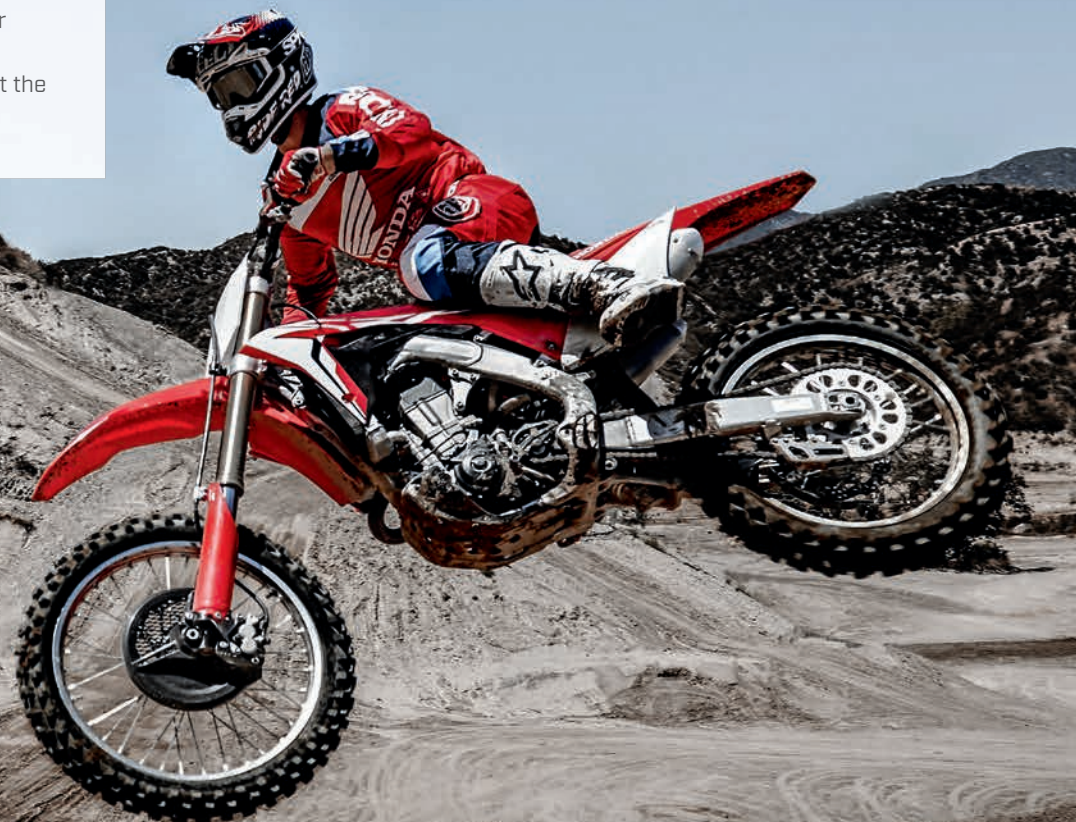
CRF450R | Professional rider on closed course.

In motocross, half the battle is getting the holeshot. That's why we've totally overhauled our 2017 CRF®450R, making it a holeshot machine. Higher compression, new downdraft air-intake layout, new aluminum frame, revolutionary titanium fuel tank and a new Showa® spring fork are just the start. And this year there's even an optional electric starter available.