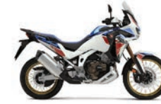
Africa Twin Adventure Sports ES