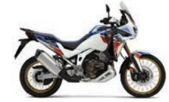
Africa Twin Adventure Sports ES DCT