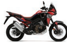
Africa Twin DCT