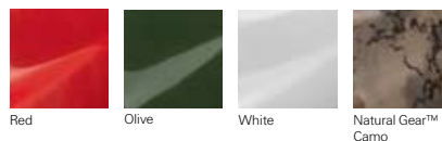
Red Olive White Natural Gear™ Camo