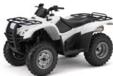
RANCHER 4X4 ES/EPS