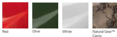
Red Olive White Natural Gear™ Camo