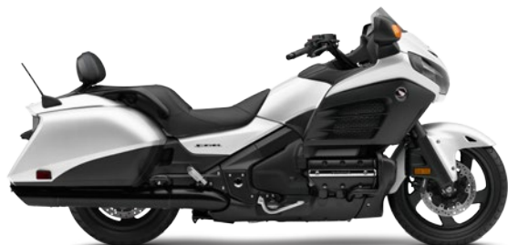
GOLD WING F6B DELUXE

The F6B Deluxe's cruise control offers a full range of features: set, resume, step up and down. It works seamlessly, and it's a real benefit on long, straight highway sections.