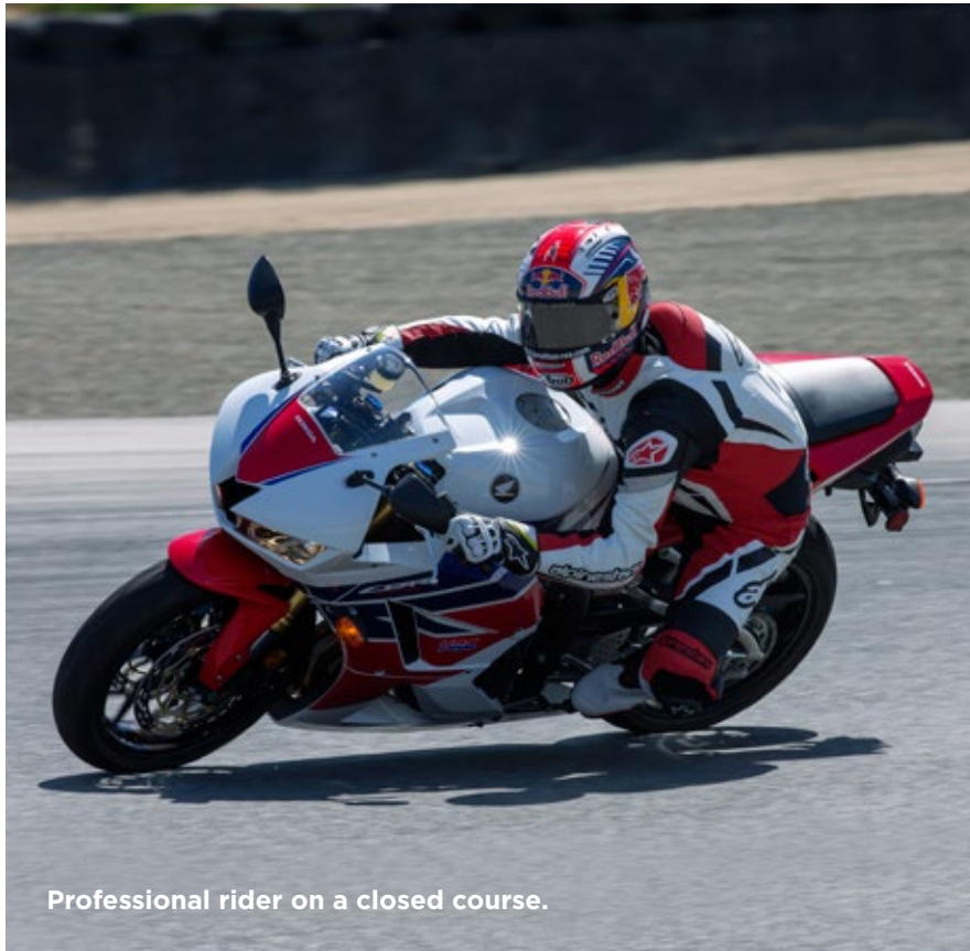
Professional rider on a closed course.